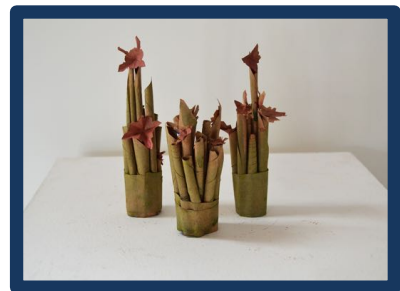
Offerings 3"x5" 2013

Remember to bring In your 'Masterpiece' to the next meeting for the Month's Artist Voting